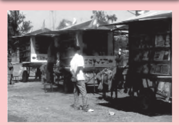
The donkey library in Hawassa bringing books to the children

Discuss ways to develop reading habits and increase knowledge and wisdom.